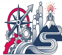
Leadership and Management Training Courses