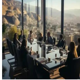
Amman - Jordan