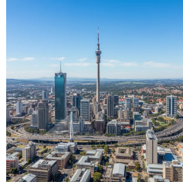
Johannesburg - South Africa