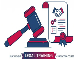
PROCUREMENT LEGAL TRAINING CONTRACTING COURSES