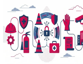
Occupational Health, Safety and Security Training Courses