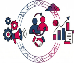
Marketing, Customer Relations, and Sales Courses