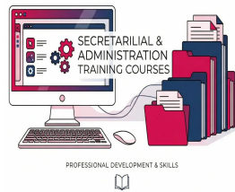
Secretarial and Administration Training Courses