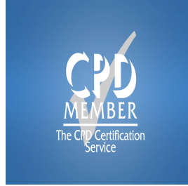
Certified Courses By International Bodies