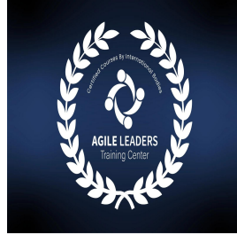
Certified Courses By International Bodies