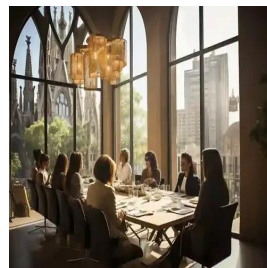
Barcelona - Spain