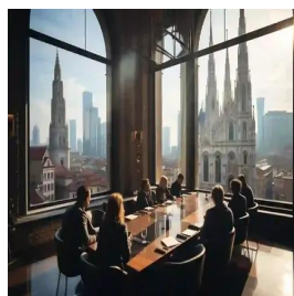
Milan - Italy