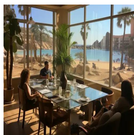
Sharm El-Sheikh - Egypt