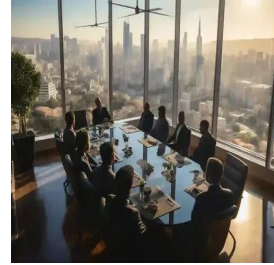
Baku - Azerbaijan