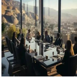
Amman - Jordan