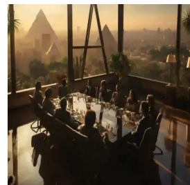
Cairo - Egypt