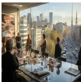
Madrid - Spain