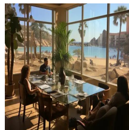
Sharm El-Sheikh - Egypt