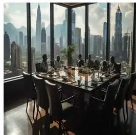
Kuala Lumpur - Malaysia