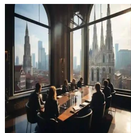
Milan - Italy