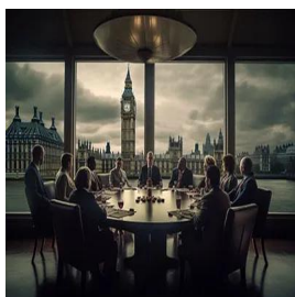
London - UK