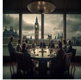
London - UK