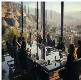
Amman - Jordan