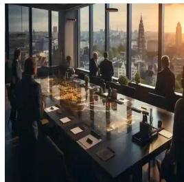
Amsterdam - Netherlands