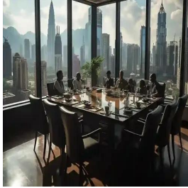
Kuala Lumpur - Malaysia