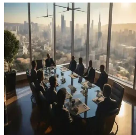
Baku - Azerbaijan