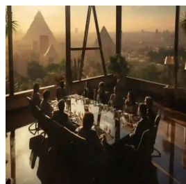
Cairo - Egypt