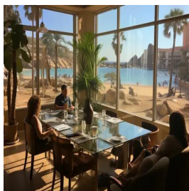
Sharm El-Sheikh - Egypt