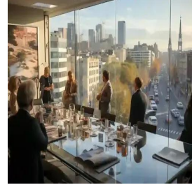
Madrid - Spain