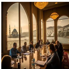
Istanbul - Turkey