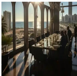
Casablanca - Morocco