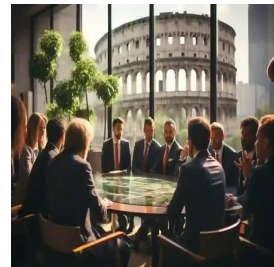
Rome - Italy