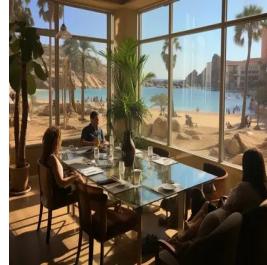
Sharm El-Sheikh - Egypt