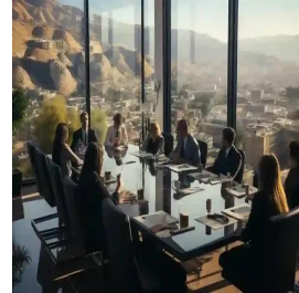
Tbilisi - Georgia