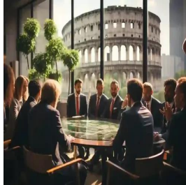
Rome - Italy