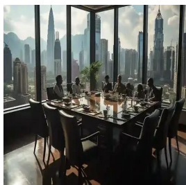
Kuala Lumpur - Malaysia