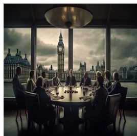
London - UK