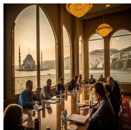
Istanbul - Turkey