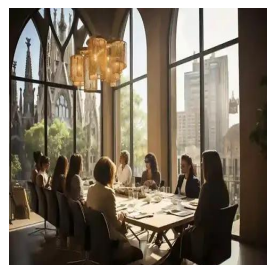
Barcelona - Spain