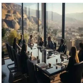
Tbilisi - Georgia