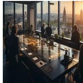
Amsterdam - Netherlands