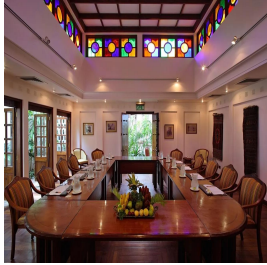
Zanzibar - Tanzania