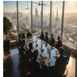
Baku - Azerbaijan