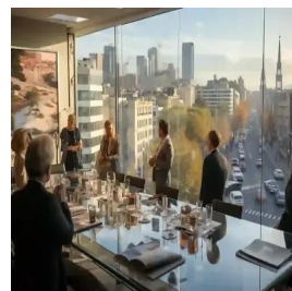
Madrid - Spain