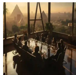
Cairo - Egypt