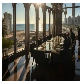
Casablanca - Morocco