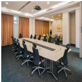
Phuket - Thailand