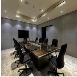
Accra - Ghana