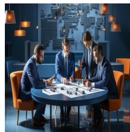
Legal Training, Procurement and Contracting Courses