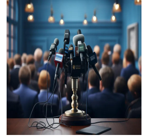
Communication and Public Relations Training Courses