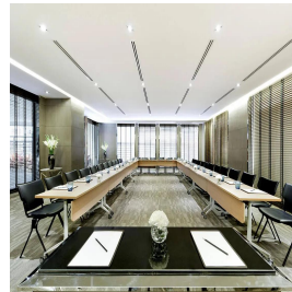
Nairobi - Kenya