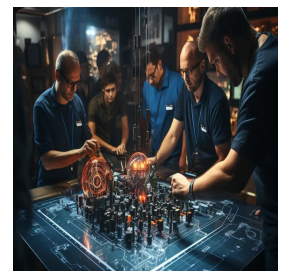
Maintenance Training and Engineering Training Courses