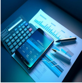
Finance and Accounting Training Courses