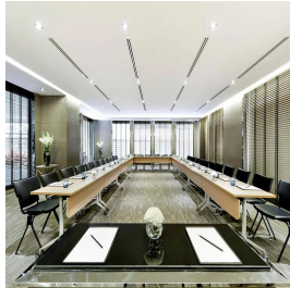
Bangkok - Thailand