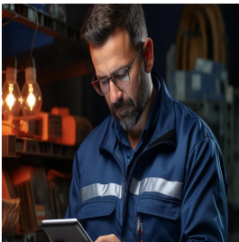
Quality and Operations Management Training Courses