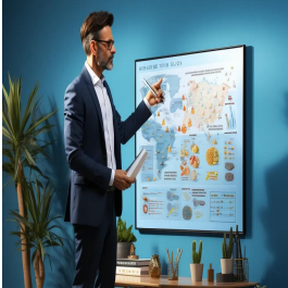
Marketing, Customer Relations, and Sales Courses