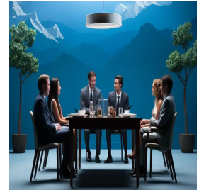
Human Resources Training and Development Courses