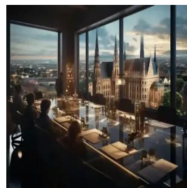
Vienna - Austria