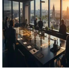
Amsterdam - Netherlands