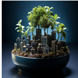
Environment & Sustainability Training Courses