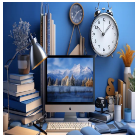
Secretarial and Administration Training Courses