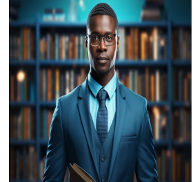
Personal & Self-Development Training Courses