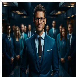
Leadership and Management Training Courses