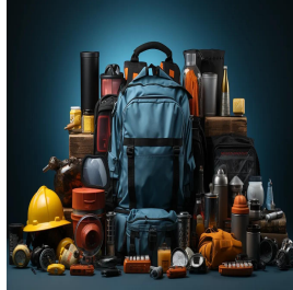
Occupational Health, Safety and Security Training Courses