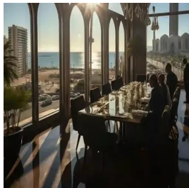
Casablanca - Morocco