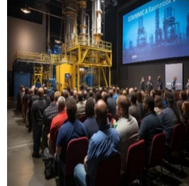
Oil & Gas Training and Other Technical Courses