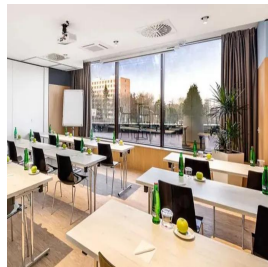
Prague - Czech Republic