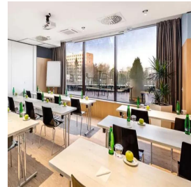
Prague - Czech Republic