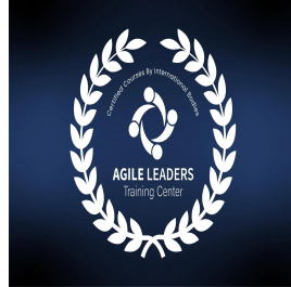
Certified Courses By International Bodies