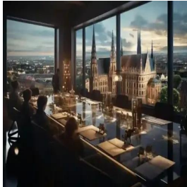
Vienna - Austria