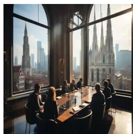
Milan - Italy