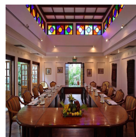
Zanzibar - Tanzania