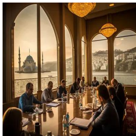
Istanbul - Turkey