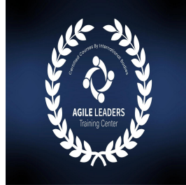
Certified Courses By International Bodies