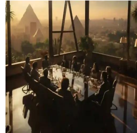
Cairo - Egypt