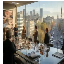
Madrid - Spain