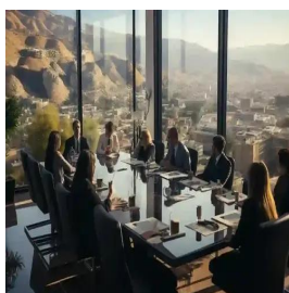
Tbilisi - Georgia