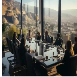
Amman - Jordan