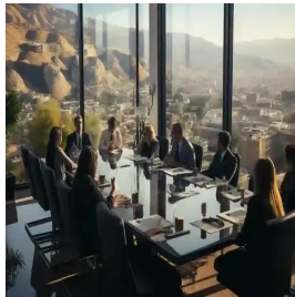
Amman - Jordan