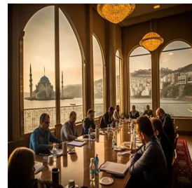
Istanbul - Turkey