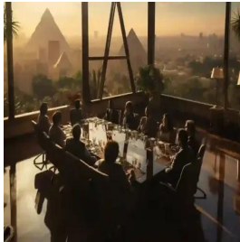
Cairo - Egypt