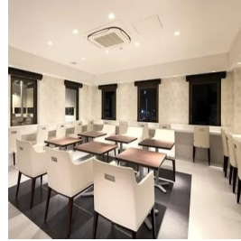
Tokyo - Japan