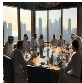
Manama - Bahrain