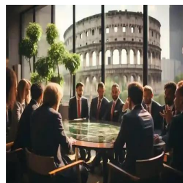
Rome - Italy