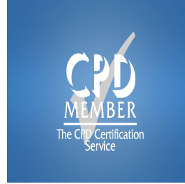
Certified Courses By International Bodies