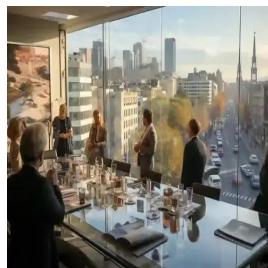
Madrid - Spain