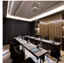
Langkawi - Malaysia