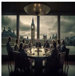
London - UK