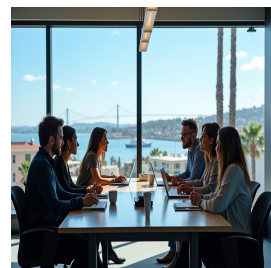
San Diego - USA