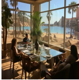
Sharm El-Sheikh - Egypt