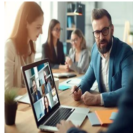
Zoom - Online Training