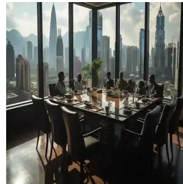
Kuala Lumpur - Malaysia