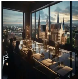
Vienna - Austria