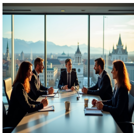
Munich - Germany