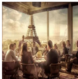
Paris - France