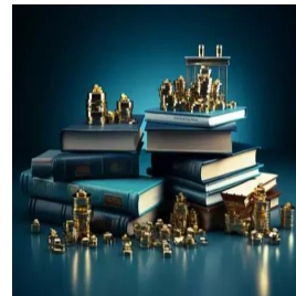
Governance, Risk and Compliance Training Courses