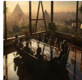
Cairo - Egypt