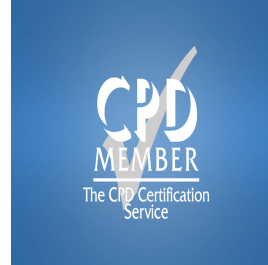
Certified Courses By International Bodies