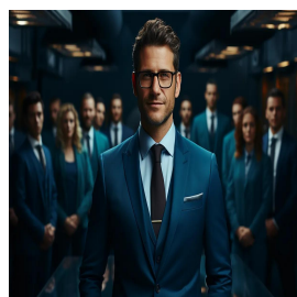
Leadership and Management Training Courses