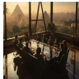
Cairo - Egypt