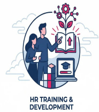
Human Resources Training and Development Courses