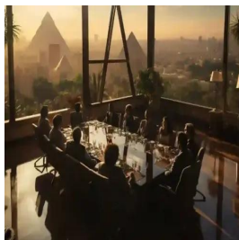
Cairo - Egypt