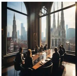
Milan - Italy