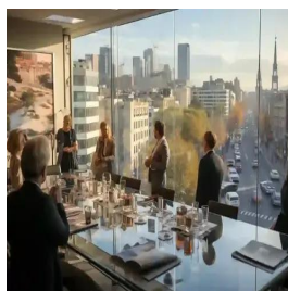
Madrid - Spain