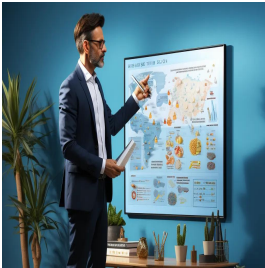
Marketing, Customer Relations, and Sales Courses