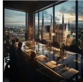
Vienna - Austria