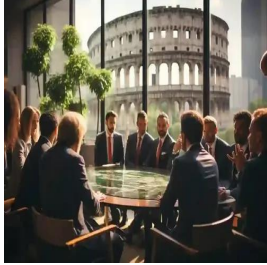
Rome - Italy