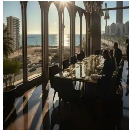
Casablanca - Morocco