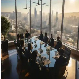
Baku - Azerbaijan