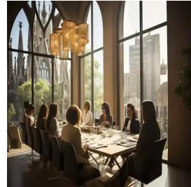
Barcelona - Spain