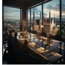
Vienna - Austria