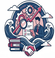
Quality and Operations Management Training Courses