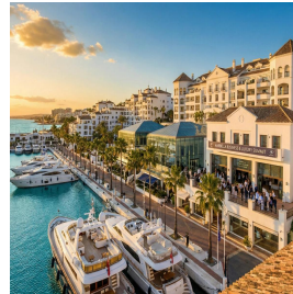
Marbella - Spain