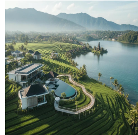
Bali - Indonesia