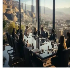
Amman - Jordan