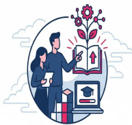
HR TRAINING & DEVELOPMENT