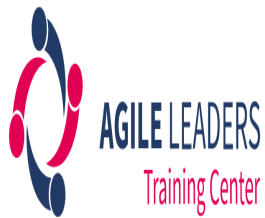
Johannesburg - South Africa