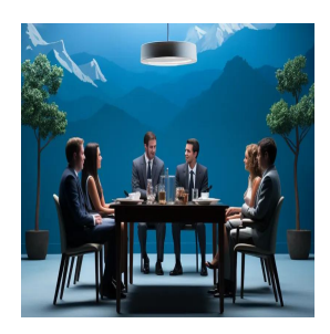
Human Resources Training and Development Courses