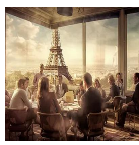
Paris - France