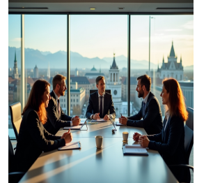
Munich - Germany