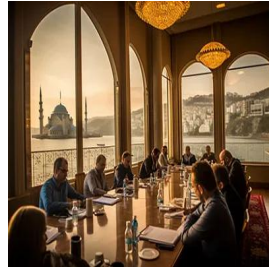
Istanbul - Turkey