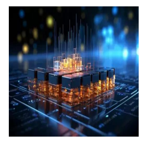
Data Analytics Training and Data Science Courses