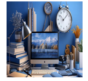
Secretarial and Administration Training Courses