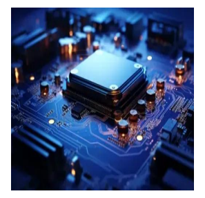
IT Security Training & IT Training Courses