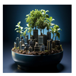
Environment & Sustainability Training Courses