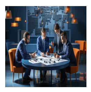
Legal Training, Procurement and Contracting Courses