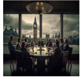
London - UK