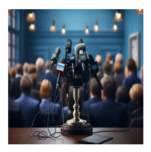
Communication and Public Relations Training Courses