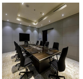
Accra - Ghana