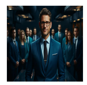
Leadership and Management Training Courses