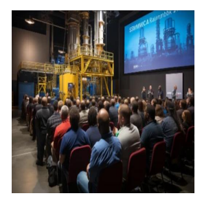
Oil & Gas Training and Other Technical Courses