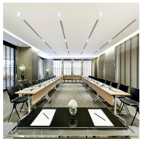
Nairobi - Kenya