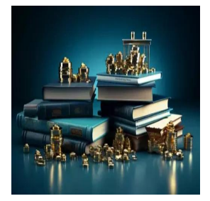
Governance, Risk and Compliance Training Courses