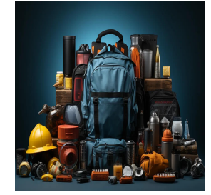
Occupational Health, Safety and Security Training Courses