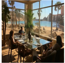
Sharm El-Sheikh -Egypt