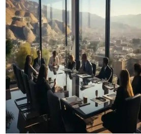
Amman - Jordan