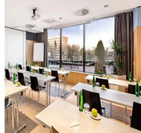
Prague - Czech Republic