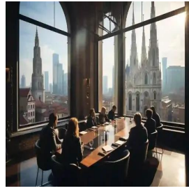
Milan - Italy