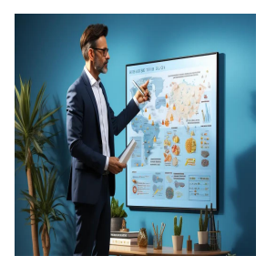
Marketing, Customer Relations, and Sales Courses