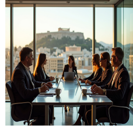
Athens - Greece