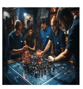
Maintenance Training and Engineering Training Courses