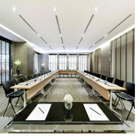
Bangkok - Thailand