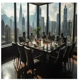
Kuala Lumpur -Malaysia