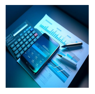
Finance and Accounting Training Courses