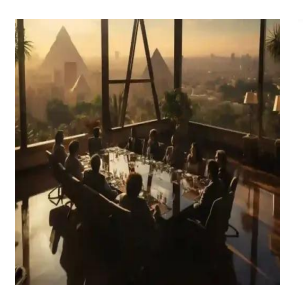
Cairo - Egypt