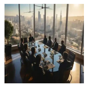
Baku - Azerbaijan