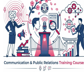
Communication and Public Relations Training Courses