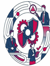
Governance, Risk and Compliance Training Courses