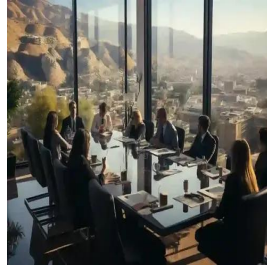
Amman - Jordan