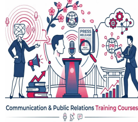
Communication and Public Relations Training Courses