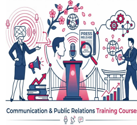
Communication and Public Relations Training Courses