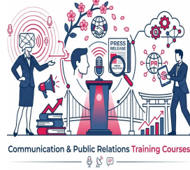
Communication and Public Relations Training Courses