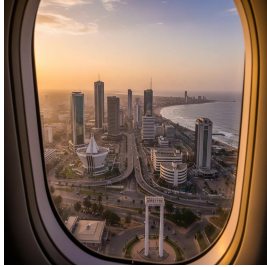
Accra - Ghana