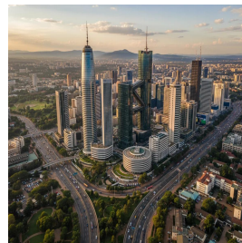
Nairobi - Kenya