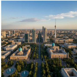
Tashkent - Uzbekistan