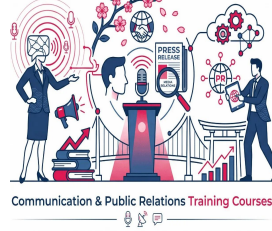
Communication and Public Relations Training Courses