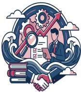
Quality and Operations Management Training Courses