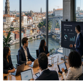
Porto - Portugal