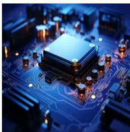
IT Security Training & IT Training Courses