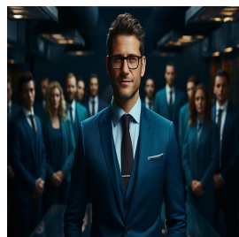
Leadership and Management Training Courses