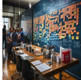
Agile PM and Project Management Training Courses