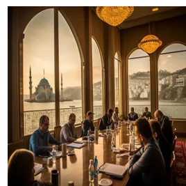
Istanbul - Turkey