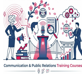
Communication and Public Relations Training Courses