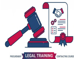
Legal Training, Procurement and Contracting Courses