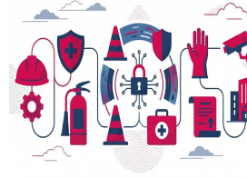
Occupational Health, Safety and Security Training Courses