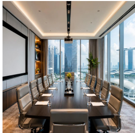
Singapore - Singapore