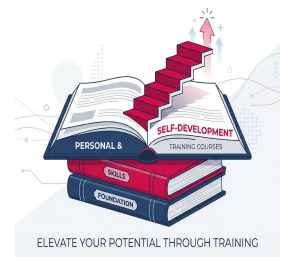
Personal & Self-Development Training Courses