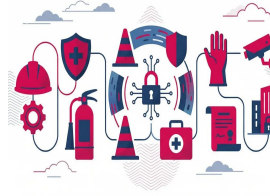
Occupational Health, Safety and Security Training Courses