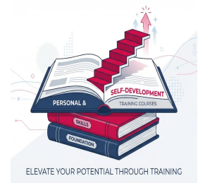
Personal & Self-Development Training Courses