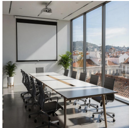
Lisbon - Portugal