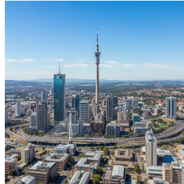
Johannesburg - South Africa