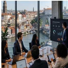
Porto - Portugal